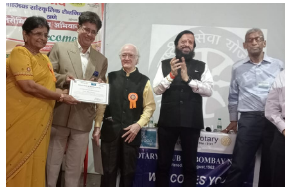
2nd Aug'25- Thalassemia Testing & Awareness at Lilavati Dayal School