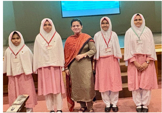
1st Aug'25- Interact Learning Assembly Sanskar at Mayor's Hall