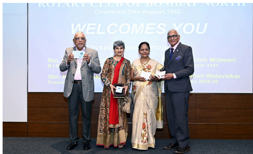
Release of Club Roster