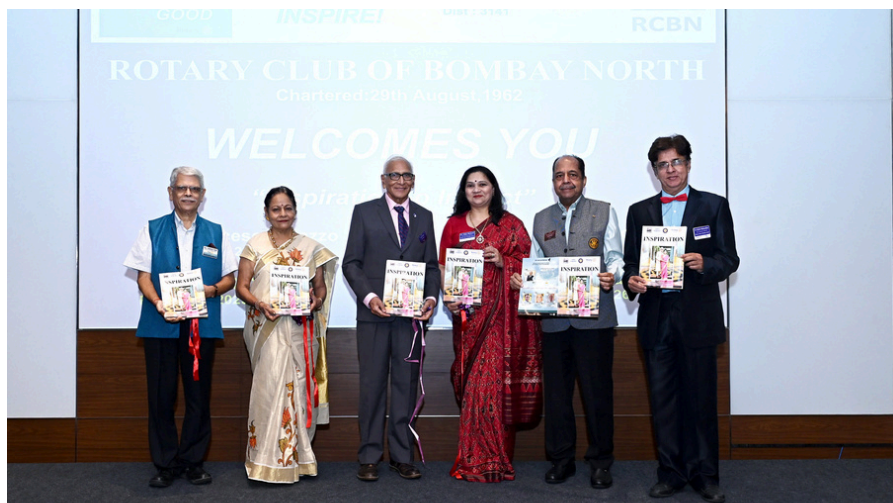
Release of Inspiration Magazine