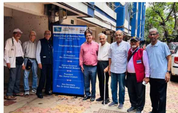
10th Aug'25- Medical and Breast screening Camp at SRA Dharavi