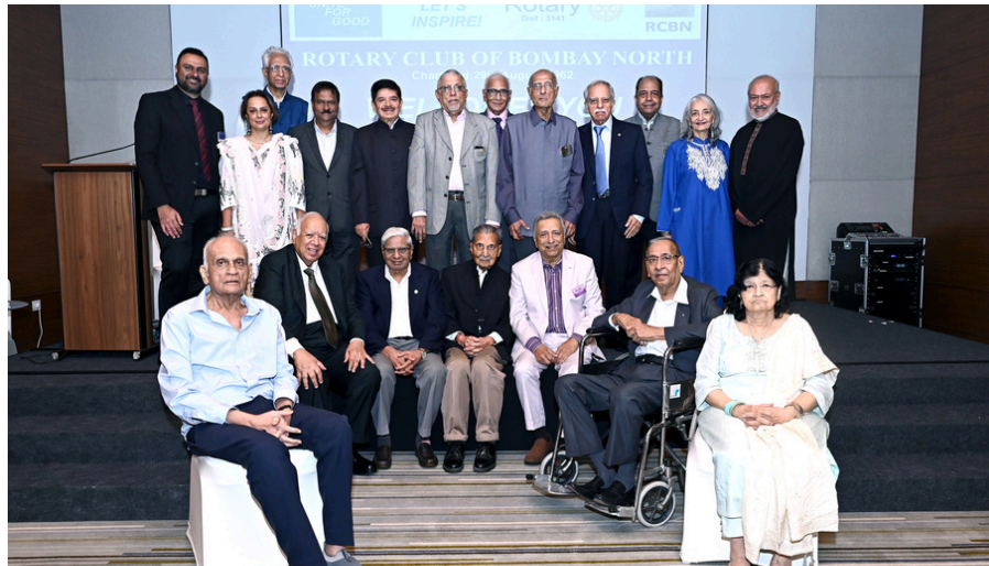
Our Past Presidents